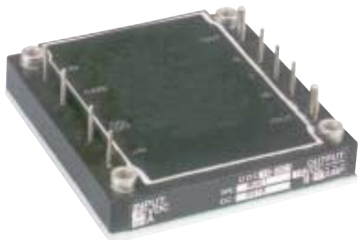
Size: 60.70mm x 57.91mm x 13.30mm (2.39in. x 2.28in. x 0.52in.)