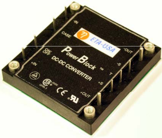
Size: 60.70mm x 57.91mm x 13.30mm (2.39in. x 2.28in. x 0.52in.)